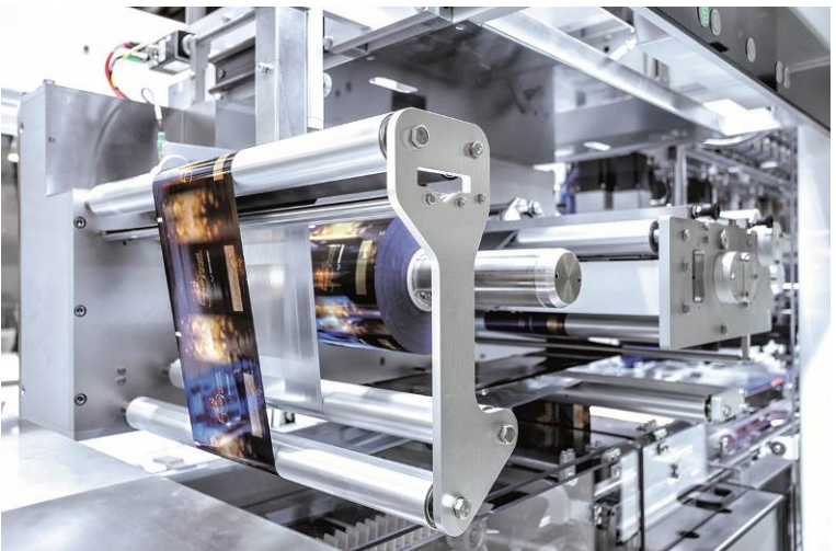
The Flowmodul enables the seamless packaging of products such as confectionery, cosmetics and pharmaceuticals in flowpacks within Schubert's proven top-loading packaging machines.