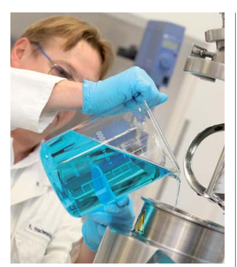
Formula in pilot approach

Here you will find a completely tiled room, which is divided into the production, cleaning, and disinfection areas through a number of sluices. We manufacture liquid, paste-like and powder products here, physi-