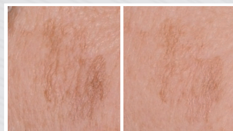
D0 before treatment