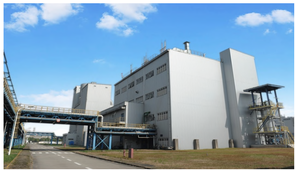
WACKER's plant for vinyl acetate-ethylene (VAE) copolymer dispersions in Nanjing, China. Capacity expansion measures are planned there, as well as at the Group's silicone site in Zhangjiagang.